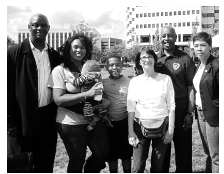
BCHT friends with mayor and staff

On October 30, A Safer Way to Spend Halloween was sponsored by the Trenton Police and Firefighters. This was a Trunk or Treat giveaway for the little ones in the Police Headquarters parking lot and a Basketball Tournament for teens. BCHT was one of the organizations that provided a trunk full of treats. Fun was had by all!