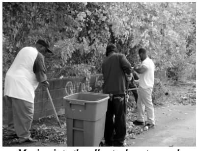
Moving into the alley to do extra work