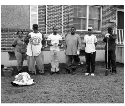
Landscaping on Walnut Avenue

Community members have recently completed three garden projects at several BCHT sites, shown above, including our latest fix-up home (more on this in our next newsletter). While the volunteers were working, neighbors came outside to trim their own bushes and help clean up an alley. It was a good and rewarding effort by all, and we are looking forward to seeing results next summer and sharing them with you.