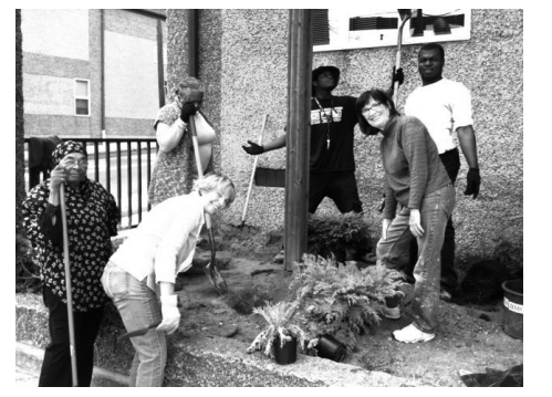
Isles helps with plantings at BCHT E. State St. office