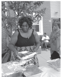
Serving the bounty