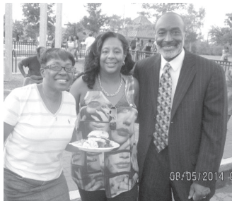
Community organizer, Councilwoman, Fire Director