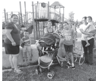
Family fun in the park