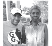
At Nat'l Night Out

THANK YOU for your support and prayers as we CO-CREATE a better worldview.