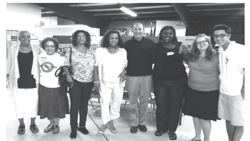
BCHT and Citizens Campaign members at Trenton 250 Meeting