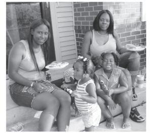
A picnic on the front stoop