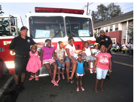
Kids and firefighters at the fire truck