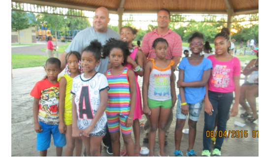
Police with kids playing to win goldfish