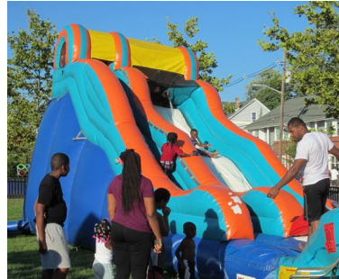
Fun on waterslide